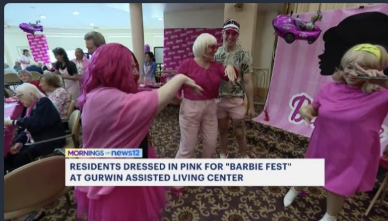
MORNINGS on news12 RESIDENTS DRESSED IN PINK FOR "BARBIE FEST" AT GURWIN ASSISTED LIVING CENTER

The two-day celebration featured Barbie makeovers in its Barbie Dream Salon, where they got manicures, makeup and even hot pink hair extensions.