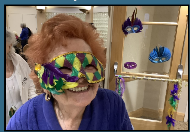
International Women's Day 3-8-23