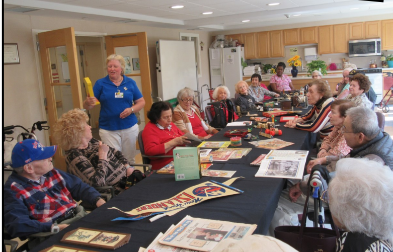
SOME OF OUR FUN ACTIVITIES INCLUDED THE DRUM CIRCLE, A REDISCOVERY OF “ANTIQUE TOYS” AND MAKING BALLOON ANIMALS!