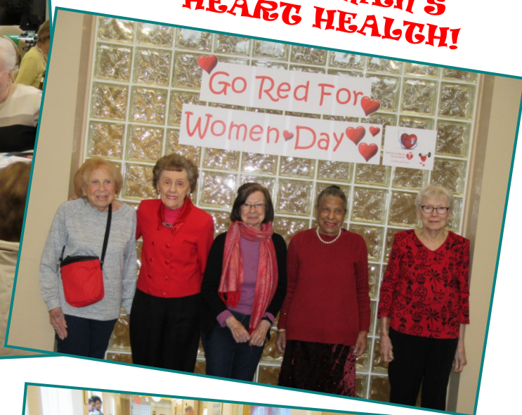
ABOVE RIGHT: WE HAD A GREAT TURNOUT FOR WOMEN'S HEART DAY ON FEBRUARY 1st. ALMOST ALL THE LADIES AND MANY GENTLEMEN WORE RED!